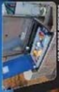
ARB FRIDGE FREEZERS