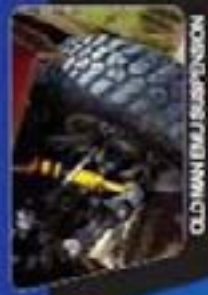
OLD MAN EMU SUSPENSION