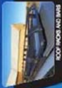
ROOF RACKS AND BARS