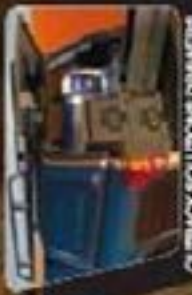
OUTBACK SOLUTIONS DRAWERS